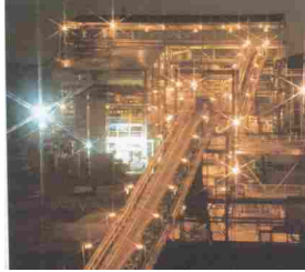
PROCESS CONVEYING ?