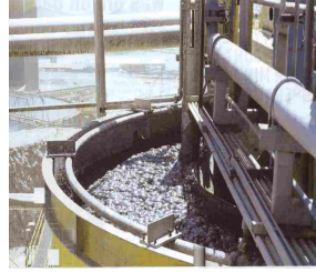
PASTE TRANSFER ?